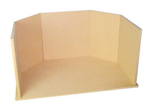
Grand Room Box #9998 · 197/8"W x 10"H x 133/4"D