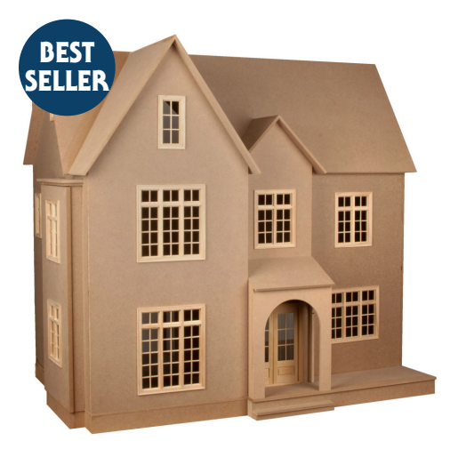
Brentwood #41045 • 36½"W x 33½"H x 25"D