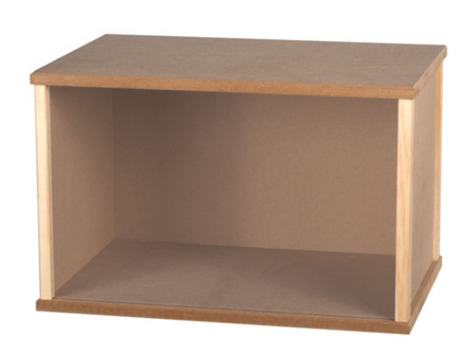
Large Display Box #9046 · 151/4"W x 93/4"H x 103/8"D