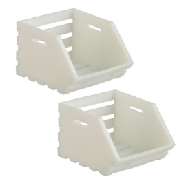
2 Vegetable Crates #9415 · 11/8"W x 3/4"H 11/4"D