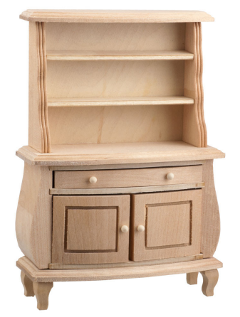
Bombe Hutch #80645 • 41/4"W x 61/4"H x 13/4"D