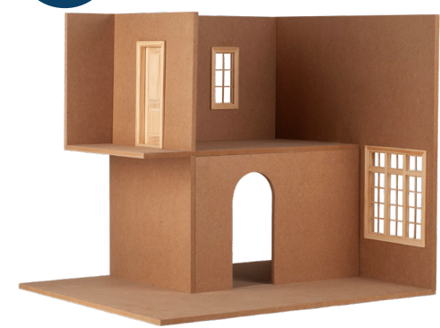
Loft Apartment #42006 · 22"W x 18¾"H x 18"D