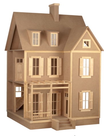
Spring Run Farmhouse #83041 · 29"W x 45"H x 28"D