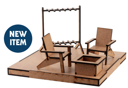
Apres Ski Kit #14419 · 8"W x 5"H x 8"D