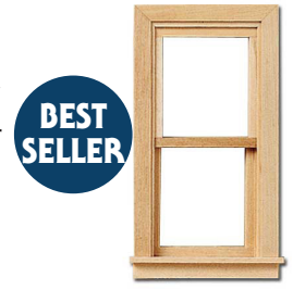
Traditional Working #5000 • 231/32"W x 551/6"H x 1/4"D

Call or email us to learn more about other options and measurements.