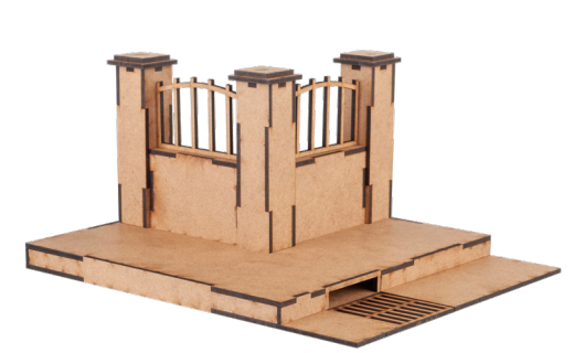
City Street Corner #14419 · 10"W × 5"H × 8"D