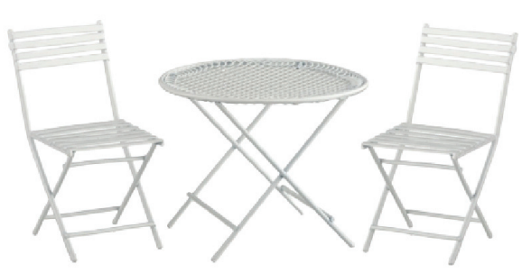
White Wire Table and Chairs Set #55138 · Chairs: 31/4"H x 15/8"W x 2"D Table: 33/8"Dia. x 25/8"H