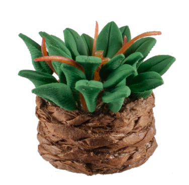
Leafy Green Plant in Basket #85033 · Approx. 1/2 "Dia. x 1/2 "H