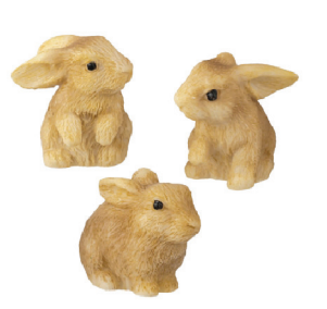
Large Rabbit Family Set #55226 · Ea. 11/8"W x 1"H