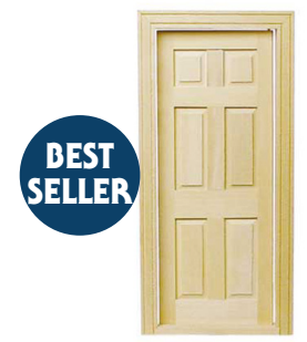
6-Panel Traditional #6007 · 37/6"W x 73/6"H x 1/8"D