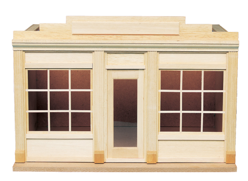
2-Window Shop #9993 · Base 16"W x 11½"H x 13"D