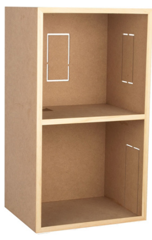
Two-Story Modular Room Box #2392 · 111/2"W x 21"H x 95%"D