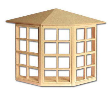
24-Light Bay Window #5008 • 95% "W x 613% "H x 2"D