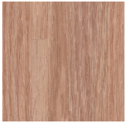
Red Oak Random Plank #2389