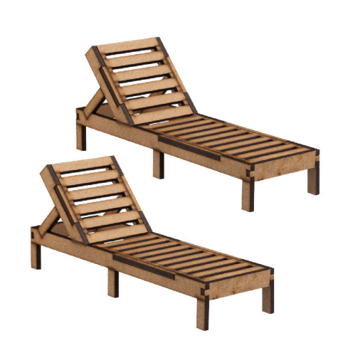
Chaise Lounge Chairs Kit #14496 · Each 6"W x 21/2"H x 2"D Houseworks® 13