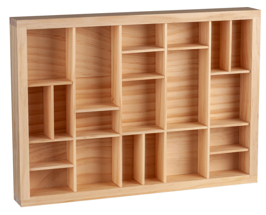
Printers Tray #42001 · 14"W x 10"H x 15/8"D