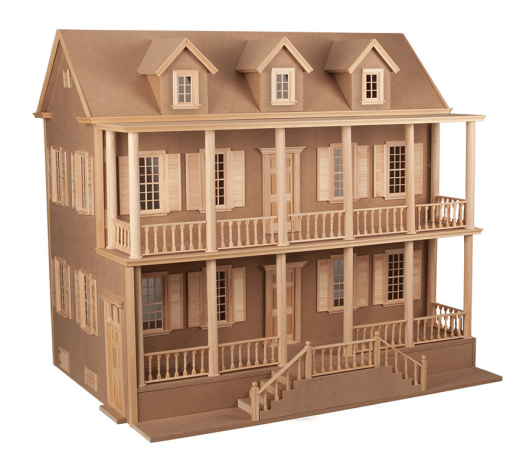
Charleston #41049 · 24"W x 30½"H x 33"D