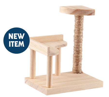
Kitty Tree #42005 · 3"W x 3½"H x 2"D