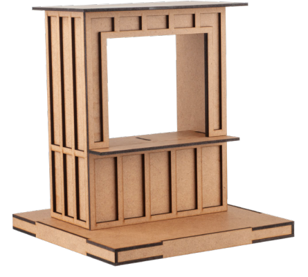
Coffee Spot Kit #14418 · 8"W x 83/4"H x 8"D