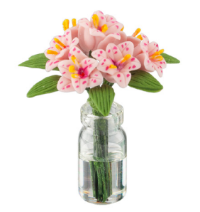
Pink Daylily Bouquet #44201 · 11/4"Dia. x 15/8"H