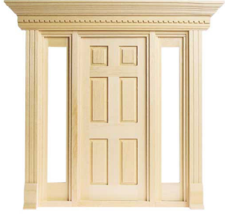
Jamestown #6010 · 8% "W x 81/6" H x 13/6" D