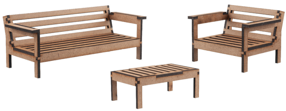
Outdoor Furniture Kits (Sold Separately) Bench #14416 · 3 ½"W x 25%"H x 23/4"D | Table #14417 · 3½"W x 15%"H x 2"D Armchair #14415 · 3½"W x 25/6"H x 23/4"D