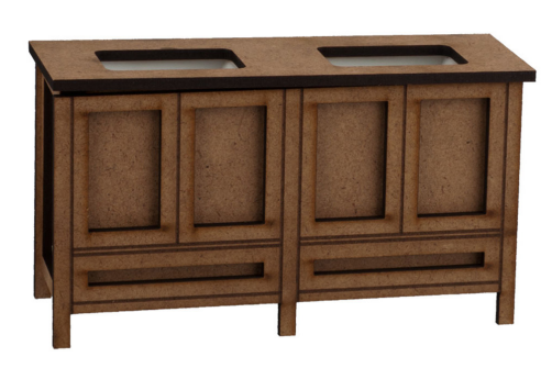
Hanna Double Vanity Kit #56202 · 51/8" x 27/8"H x 17/8"D Without Sink #46202