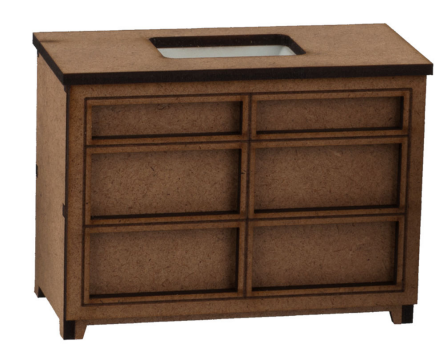
Wide Single Vanity Kit #56203 · 37/8"W X 27/8"H X 17/8"D Without Sink #46203