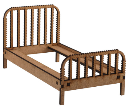
Hanna Single Bed Kit #46201 · 33% "W x 31/4" H x 65% "D