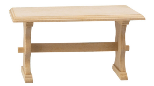
Trestle Table #56712 · 43½"W x 2½"H x 2¾"D