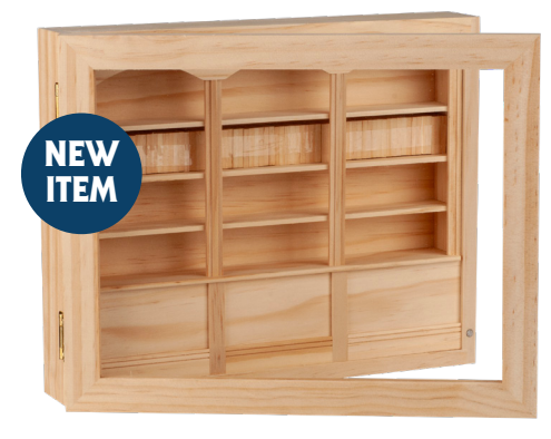
Bookcase in a Case Set #42003 · 101/8" x 81/8" x 2"D