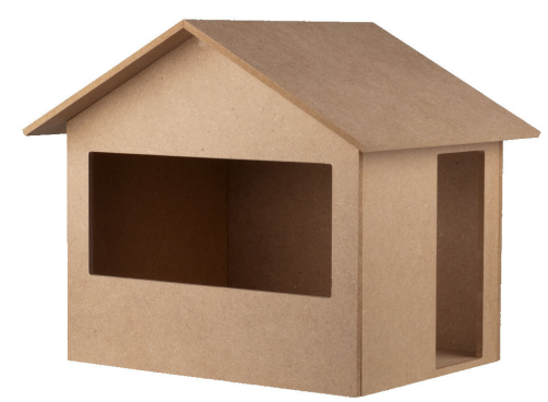
Martin's Market Stall #42023 · 14"W x 11½"H x 11"D