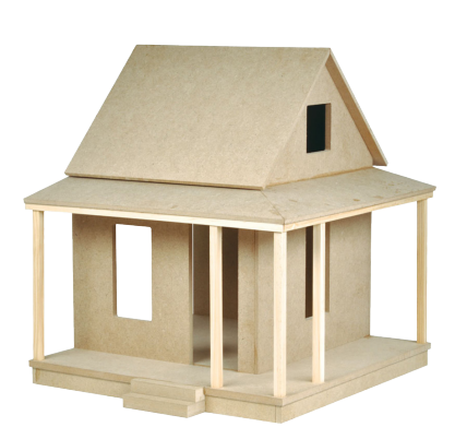
Lisa's Country Cottage #29903 · 16"W x 18"H x 18½"D