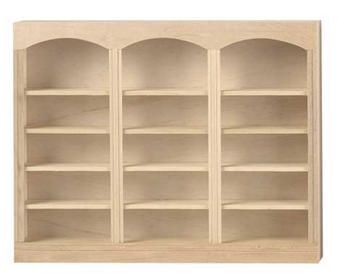
3-Section Bookcase #5011 · 95/16"W x 73/8"H x 15/16"D (Fully-Shelved)