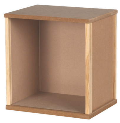
Small Display Box #9044 · 83/4"W x 93/8"H x 63/4"D