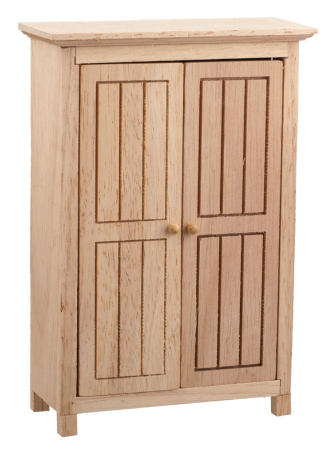
Beadboard Wardrobe #80687 · 4"W x 6"H x 13/4"D