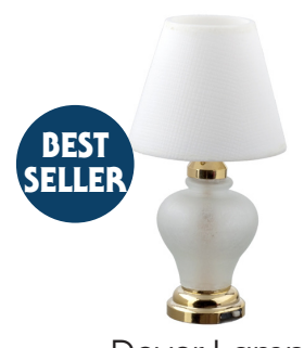
Dover Lamp #2304 · 23/4"H