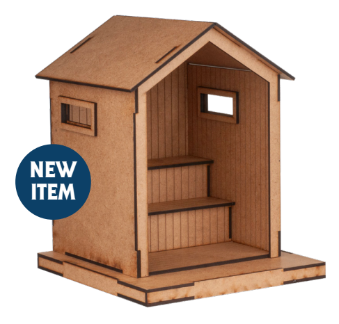
Relax and Recharge Sauna Kit #14431 · 8"W x 9<sup>3</sup>/<sub>4</sub>"H x 8"D Includes an Etched Acrylic Front