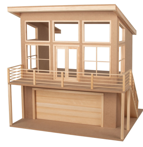
Contemporary #41048 · 25"W x 25¾"H x 23"D