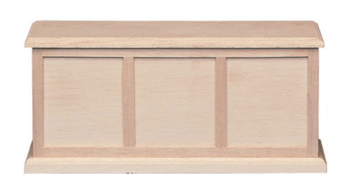
Open-Back Store Counter #9953 \cdot 67/6"W x 215/6"H x 21/6"D