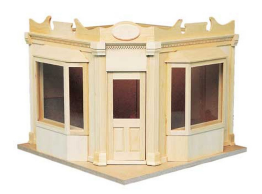
Corner Shop #9991 · Base 13"W x 111/4"H x 13"D 8 Houseworks®