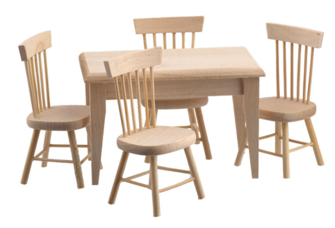
5-Pc. Kitchenette Set #90689 · Table 4½"W x 2½"H x 2½"D Chairs 1¾"W x 3½"H x 1½"D