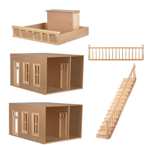
Yorkville 2-Story and Terrace #51039 Visit miniatures.com for measurements Houseworks® 7