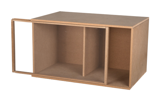
Extra Large Display Box #9047 · 205 "W x 117 "H x 133 "D