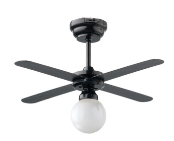
Black Ceiling Fan #2384 · 3½"Dia.

New and exciting options coming soon! Call or email us to learn more.