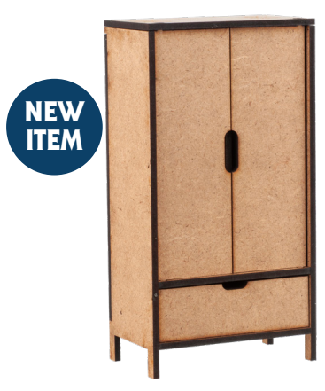
Thompson Wardrobe Kit #14426 • 3 1/4"W x 6 1/4"H x 2"D