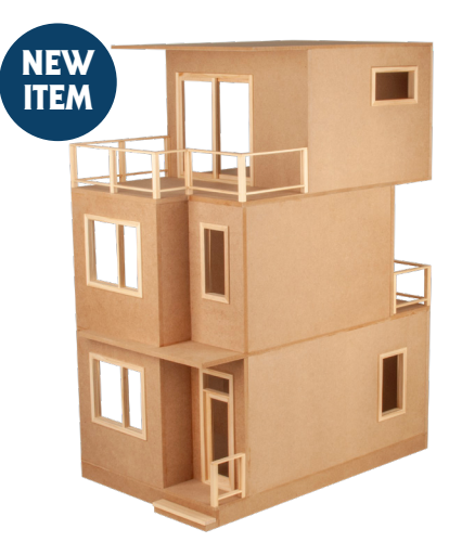
Urban Town #41090 · 147/8"W x 32"H x 24"D

Both beginners and aficionados will appreciate our diverse range of designs, including traditional, modern, contemporary, and farmhouse designs.