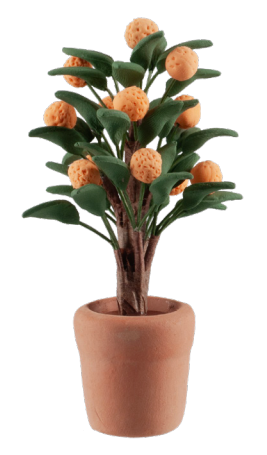
Orange Tree in Terra-Cotta Pot #85014 · Approx. 7/8"Dia. x 23/4"H