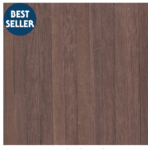
Rustic Black Walnut #2389