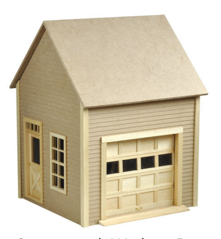
Garage with Working Door #9997 · 12½"W x 17½"H x 13"D