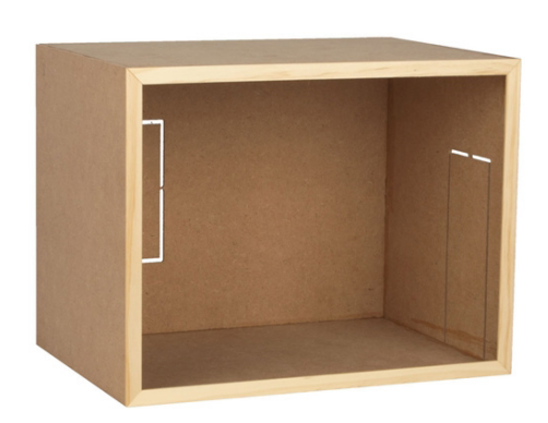
Basic Modular Room Box #2390 · 131/2"W x 101/2"H x 95/8"D