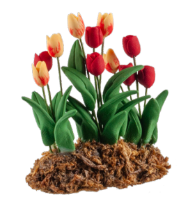
Pastel Tulips Instant Garden #85028 · 13/4" x 2"H x 5/8"D