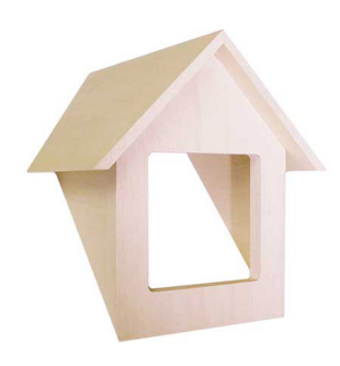
Traditional Dormer #7002 · 37/6"W x 71/8"H