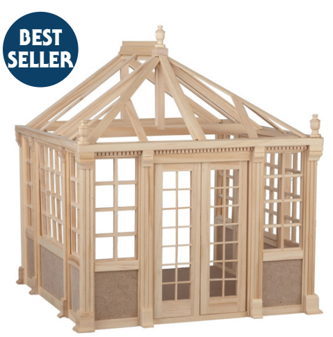
The Conservatory #9900 · 117/8"W x 131/4"H x 111/8"D