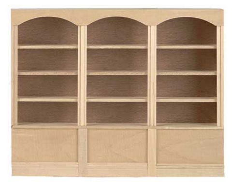
3-Section Bookcase #5009 · 95/6"W x 73/8"H x 13/8"D