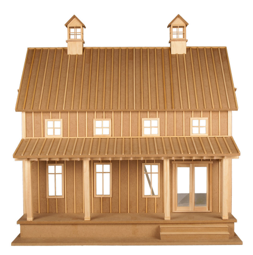
Barndominium #41080 · 31½"W x 34¼"H x 26"D