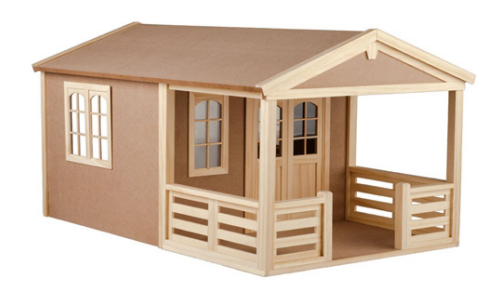
Backyard Bungalow #52016 · 121/2"W x 11"H x 20"D