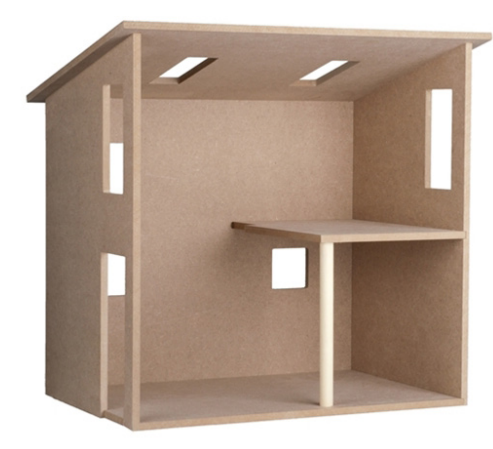
MiniTown Loft #52012 · 131/4"W x 183/8"H x 191/2"D (Component Set #52013 Sold Separately)