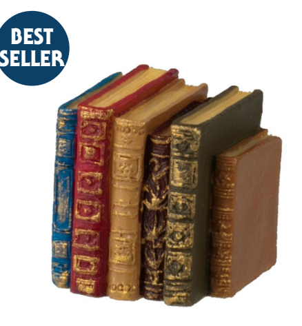
Row of Antique Books #34031 · 3/4"W x 3/4"H x 5/8"D