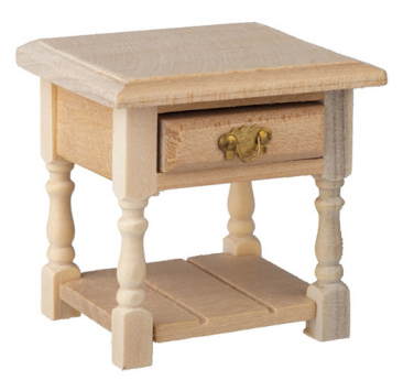
End Table #56713 · 13/4"Sq. x 13/4"H