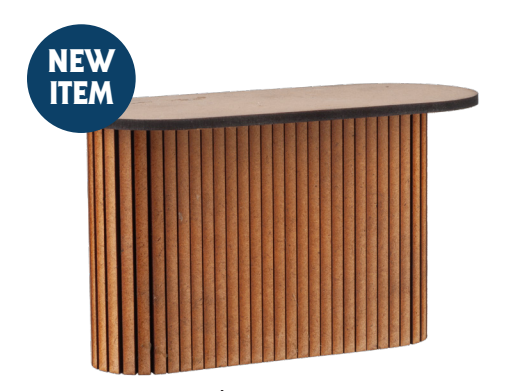
Modern Bar Kit #14422 \cdot 5"W \times 3"H \times 2\%"D