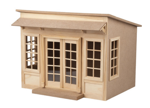
Serendipity Shed #52019 · 131/16"W x 107/8"H x 91/4"H (Front Step 1½"D)