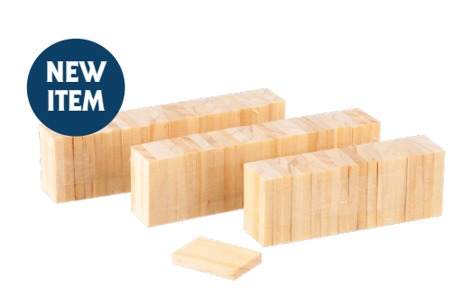
70 Book Blanks #42004 · Each % "W x % "H x 1/8" D