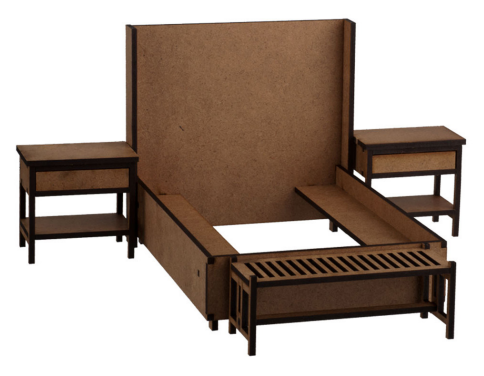
Hanna Bedroom Set Kit (4 Pcs.) #46200 · Bed 41% "W x 47% "H x 65% "D