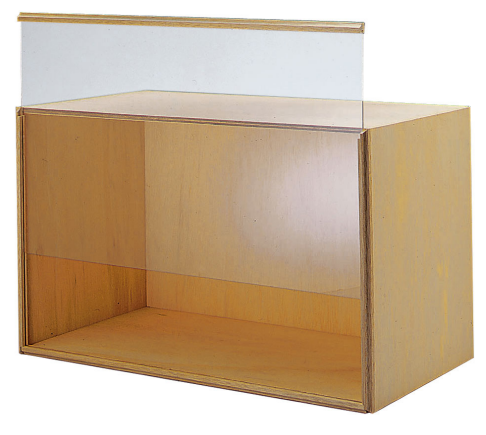
Front-Opening Display Case #59057 • 151/4"W x 103/8"H x 93/4"D