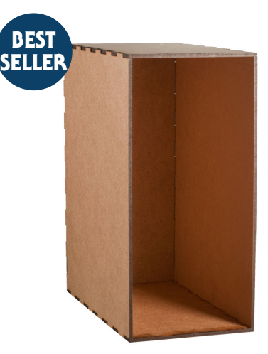
Book Nook #41404 \cdot 4\frac{1}{2} "W x 9\frac{1}{2}"H x 8"D