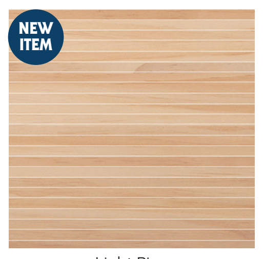
Light Pine #2388