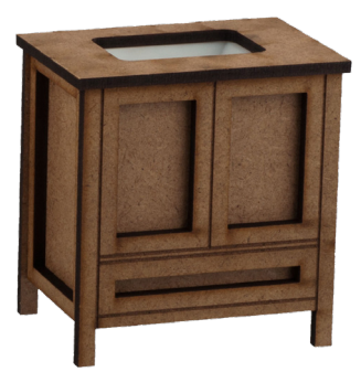
Narrow Single Vanity Kit #56204 · 25/8"W x 27/8"H x 17/8"D Without Sink #46204