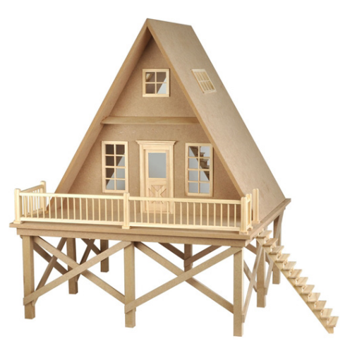
Get-A-Way Chalet #59904 · 29"W x 28½"H x 23"D