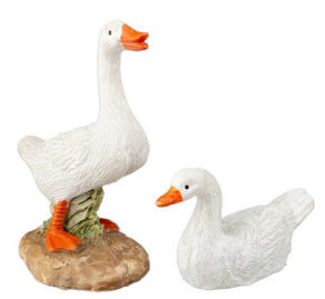
Goose and Gander #51278 · 11/8"W x 17/8"H x 7/8"D 1\frac{3}{8} "W x \frac{15}{16} "H x \frac{1}{2} "D