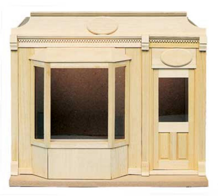
Bay Window Shop #9992 · Base 12½"W x 11"H x 13"D