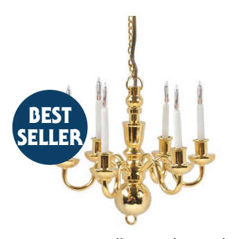
6-Candle Colonial #2524 · 43/8 "H