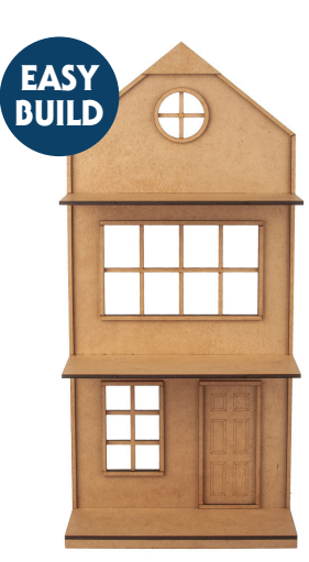
What-Not Shelf Vignette #14506 · 1013/16"W x 233/8"H x 41/8"D Houseworks® 9