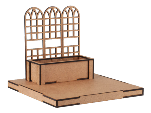
Garden Planter Corner Kit #14420 · 8"W x 611/16"H x 8"D

The Hanna Collection was designed by Kristine Hanna of Paper Doll Miniatures.