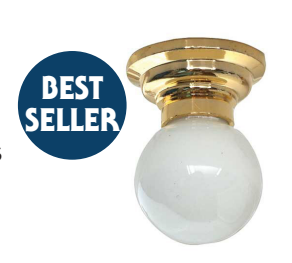
Globe #2652 · 1"H

New and exciting options coming soon! Call or email us to learn more.