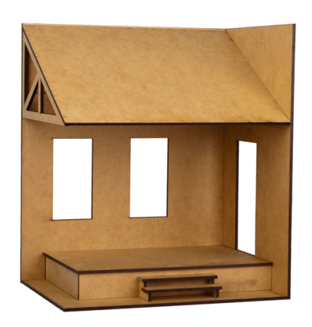
Welcome All Porch #52022 · 135/8"W x 16"H x 95/8"D