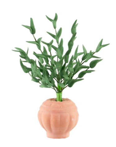
Ficus Tree in Terra-Cotta Pot #85072 · Approx. 11/8"Dia. x 31/2"H