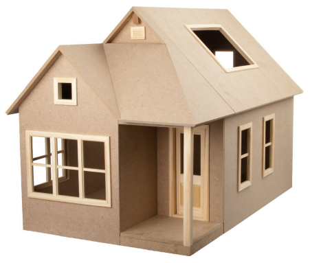
Three Gables House #52018 · 15"W x 17"H x 24"D (Does not include roof overhang)