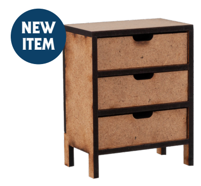
Thompson Dresser Kit #14425 \cdot 2½"W x 3½"H x 1½"D