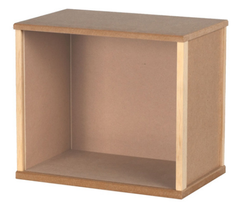
Medium Display Box #9045 · 103/4"W x 93/8"H x 63/4"D