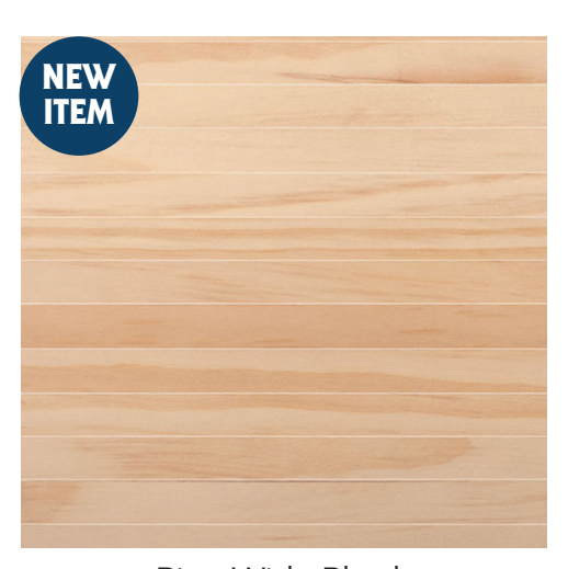
Pine Wide Plank #2393

Each sheet is 11" x 17" and covers 187 square inches.