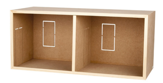
Divided Modular Room Box #2391 · 233/4"W x 101/2"H x 95/8"D