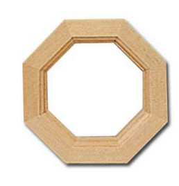
Octagonal Window #5045 · 25/4"W x 25/4"H x 1/4"D