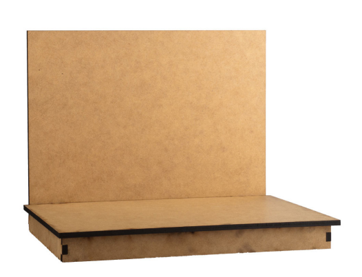
Display Vignette #14492 · 12"W x 9"H x 8½"D