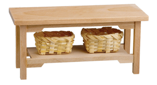
Storage Table with Two Baskets #55225 · Table 4½"W x 2½"H x 1¾"D