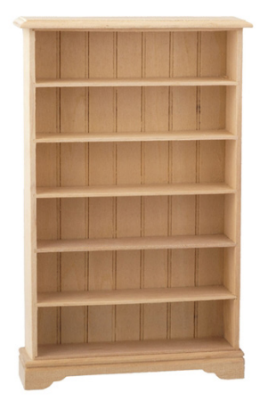
Tall Shelving Unit #55230 · 3¾"W x 6¼"H x 1"D