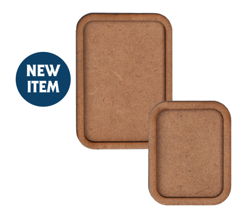
Rounded Edge Frame Set #14428 \cdot 23% "W x 33% " and 7% " x 23% " 14 Houseworks®