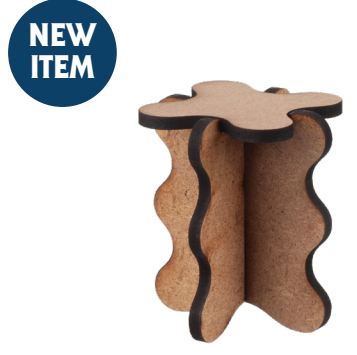
Squiggly Side Table Kit #14424 · 15/2"W x 2"H x 13/4"D