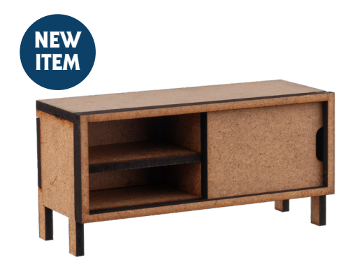
Thompson Sideboard Kit #14423 · 4"Wx 2"H x 15%"D