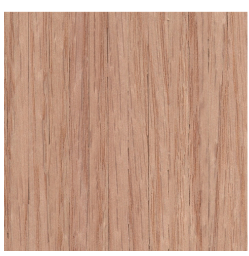
Red Oak #2386